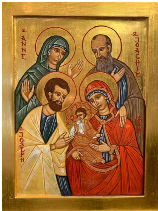
Saints Joachim and Anne, parents of Mary, with the Holy Family - Our Diocesan icon

“THERE IS NO RETIREMENT AGE FROM THE WORK OF PROCLAIMING THE GOSPEL AND HANDING DOWN TRADITIONS TO YOUR GRANDCHILDREN.”